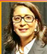
Nawal EL MOUTAWAKEL