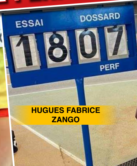
HUGUES FABRICE ZANGO