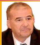
Abdel hakim DIB

Vice-president Republic of Central Africa